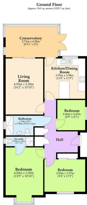
Total area: approx. 94.8 sq. metres (1020.7 sq. feet)